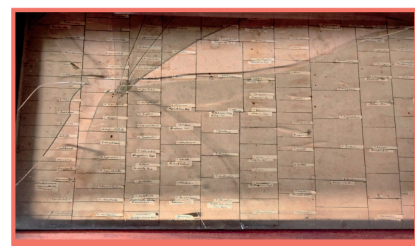
Drawer with broken glass lid