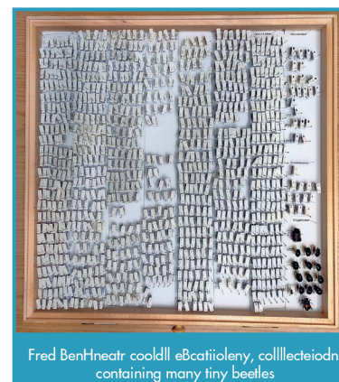
Fred BenHneatr cooll eBcattioleny, colllecteiodn t containing many tiny beetles

The first cabinets are nearly full, so we are really grateful to all of the donors that have allowed this project to continue without interruption. Once the collection has been rehoused and digitised, it will be much more accessible. Watch this drawer!