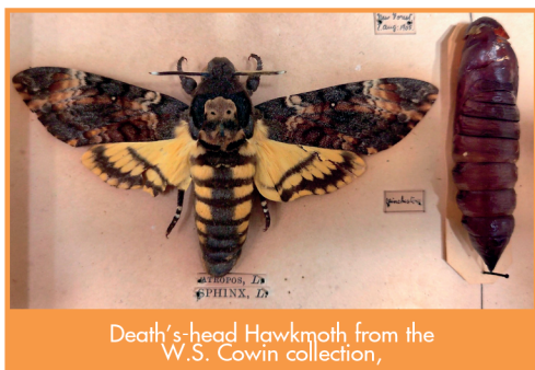
Death's-head Hawkmoth from the W.S. Cowin collection,

An important part of the project is also deaccessioning. Any material that is non-Manx will first be offered to museums with an established entomology collection in the county the specimens are from, or to a larger national museum.