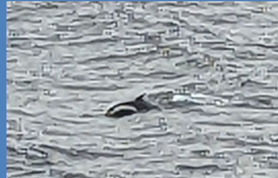
White-beaked dolphin 2024