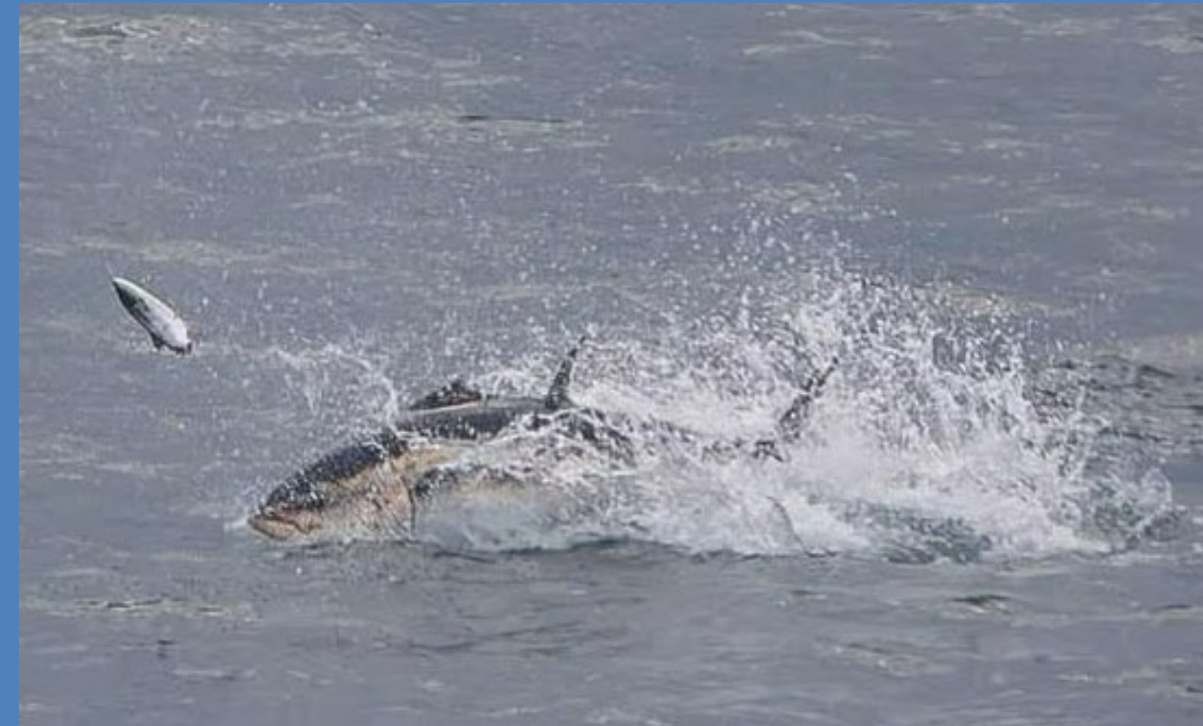
Atlantic bluefin tuna