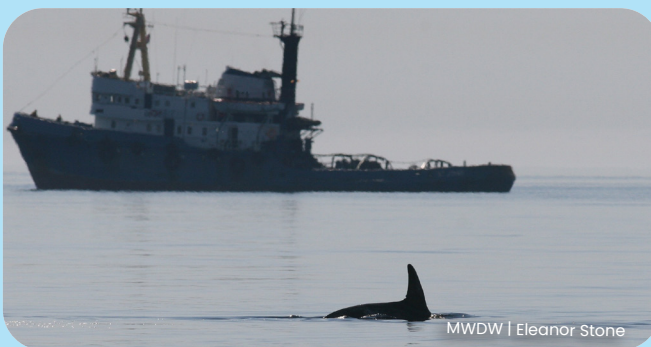
MWDW | Eleanor Stone

The information provided in this booklet brings together separate Codes of Conduct for the above species in a format that is illustrative and easy to follow. It has been developed by Manx Whale and Dolphin Watch (MWDW), Manx Wildlife Trust (MWT) and the Isle of Man Government Department of Environment, Food and Agriculture (DEFA).