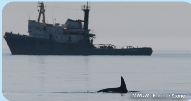
MWDW | Eleanor Stone

The information provided in this booklet brings together separate Codes of Conduct for the above species in a format that is illustrative and easy to follow. It has been developed by Manx Whale and Dolphin Watch (MWDW), Manx Wildlife Trust (MWT) and the Isle of Man Government Department of Environment, Food and Agriculture (DEFA).