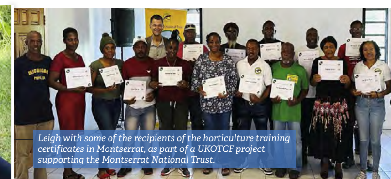
Leigh with some of the recipients of the horticulture training certificates in Montserrat, as part of a UKOTCF project supporting the Montserrat National Trust.