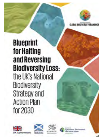
Cover of the UK's National Biodiversity Strategy.

developing TWT's understanding towards the delivery of key global treaties and programmes. To include the United Nations (UN) Framework Convention on Climate Change, Convention on Biological Diversity, and Global Biodiversity Framework.