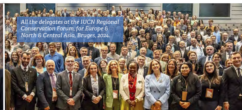
All the delegates at the IUCN Regional Conservation Forum, for Europe & North & Central Asia, Bruges, 2024.